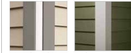
3-Piece Corner System

For a decorative 3-piece corner system, combine the corner connector with any of the window styles.