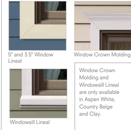
5" and 3.5" Window Lineal